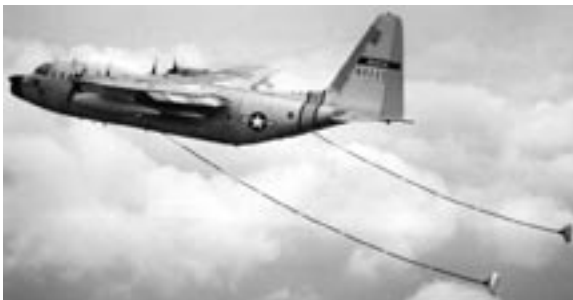
HC-130 King Bird

stops soon followed in 1970. Lessons from SEA also led to the development of the HH-53 Pave Low III night-all weather ARRS aircraft by 1976.