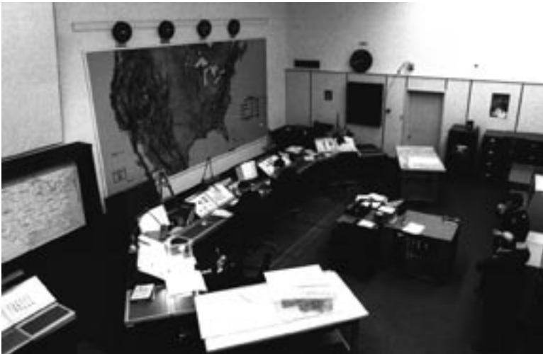
Rescue Coordination Center

During 1960, 14 air rescue squadrons were inactivated and by the end of the year ARS had three squadrons and 1,450 personnel. Yet concurrently, the USAF proposed new missions for ARS such as operating rescue centers within the United States, joint overseas centers, and local base rescue (LBR). By December of 1961, ARS was increased from three to ten air rescue squadrons and assigned the local base rescue mission with 70 LBR elements or detachments worldwide and 148 helicopters assigned for the new mission from other commands.