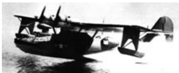
WWII OA-10 Catalina

The United States Army Air Force (USAAF) started WWII with virtually no CSAR assets and aircrews who had little survival training or gear. The advent of large American bomber, fighter, and transport fleets operating worldwide forced a requirement on the USAAF to organize a program to search and rescue crashed airmen on an international scale. Under the personal guidance of General Henry H. “Hap” Arnold, the USAAF initiated a rescue program.