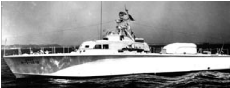
USAAF WWII Crash/Rescue Boat

United States Air Force (USAF) Combat Search and Rescue (CSAR) as known in the 21 st century, has its roots in late World War I, the 1920-30s, and the build up for World War II (WWII) prior to 7 December 1941. There are references to Army Air Service/Air Corps medical evacuation aircraft and crash rescue boats from 1918 to 1940.