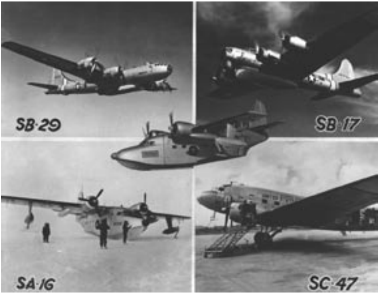
Early USAF Rescue Fixed Wing

One of the most active USAF CSAR squadrons of the Korean War was the 3 d Air Rescue Squadron (ARS). The 3 ARS penetrated deep behind enemy lines under heavy enemy fire multiple times to rescue shot down aircrew. During the course of the Korean War, the ARS airlifted 9,680 personnel to safety, 9,219 of them by helicopter. Nine hundred and ninety-six were rescued behind enemy lines with 846 of these picked up by H-5 or H-19 helicopters.