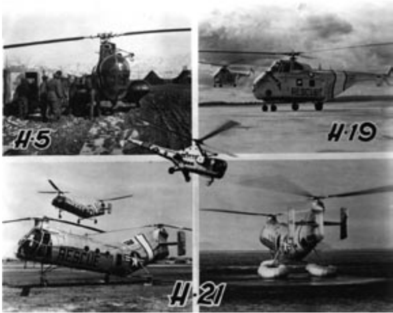
Early USAF Rescue Rotorcraft

rescue culture. He wrote the rescue code and motto, created its emblem, and fought hard for more resources. In 1947, Colonel Kight also initiated the formal founding of USAF pararescue based on heroic precedents in WWII and soon medical parachute jumpers were added to ARS.