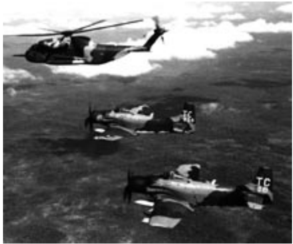
SEA War, Super Jolly with Sandy Escort

(ATAR) “Ash Can” mission was performed by ARRS when HC-130H aircraft were equipped to catch the high altitude-sampling device launched by the Air Weather Service (AWS). In 1967 two ARRS HH-3Es along with HC-130P support paralleled the original flight path of Charles