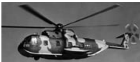
SEA War, H-3 Jolly Green

The SEA War inspired many technical developments that enhanced ARRS capability. Early 1960 development and employment into combat of the HH-3 Jolly Green and later the HH-53 Super Jolly Green helicopters were prime examples. The HH-53 had the size, range, speed, performance, armor protection, defensive systems, and guns to properly do the CSAR mission. By late 1966 air refueling of these same aircraft by HC-130 King Birds enhanced the range of ARRS. Also as early as 1966, the Fulton Surface-to-Air Recovery (STAR) system had been developed and successfully demonstrated one and two-man pickups. In 1967 the first Air-to-Air Recovery