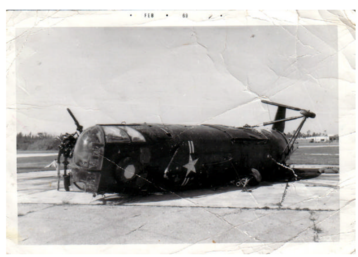
IF YOU HAVE ANY INFORMATION PLEASE LET US KNOW/PHOTO DATED FEB 1969

Did you know that 39 Air Force helicopter pilots became General Officers?